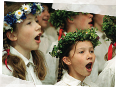
Latvia holds a national song festival every 5 years.